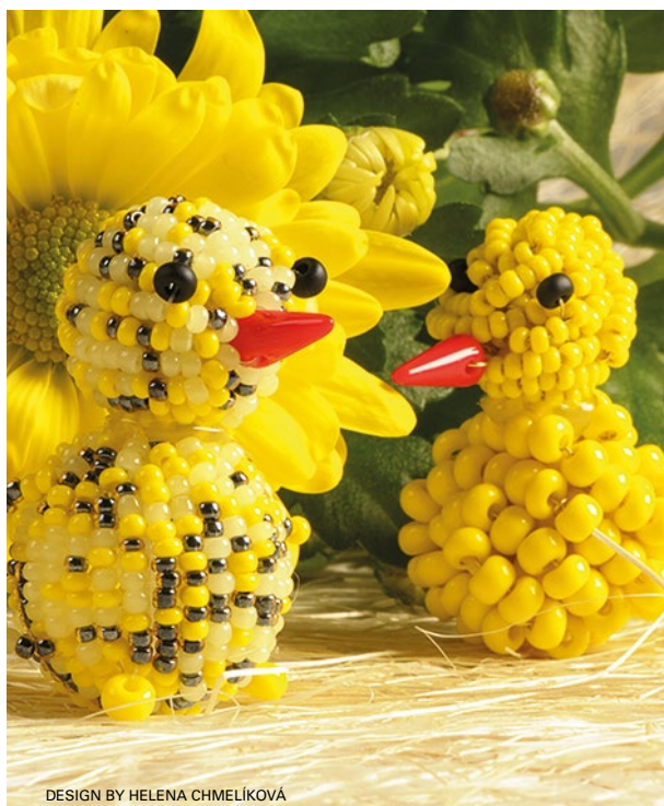
DESIGN BY HELENA CHMELIKOVÁ