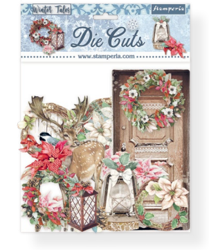
35 pcs DFLDC42