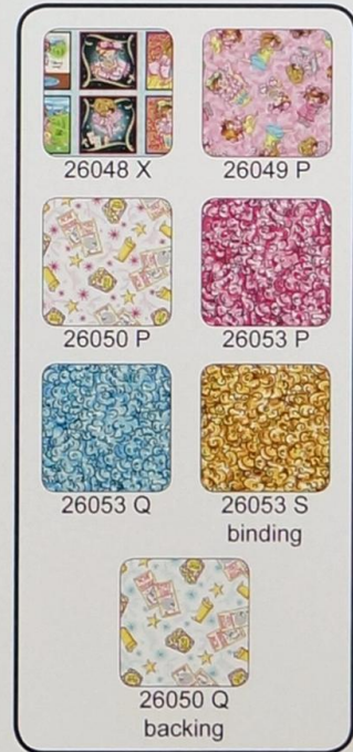
Quilt Designed by Creative Sewlutions 77" x 99"