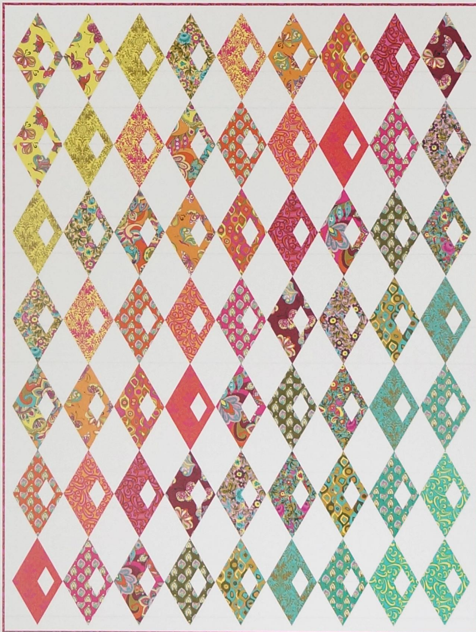
Quilt Designed by Sassafras Lane Designs 58" x 77"