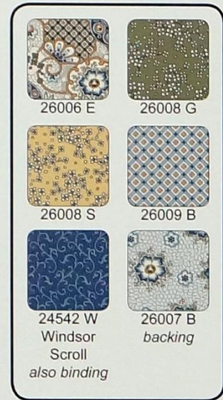
Quilt Designed by Creative Sewlutions 60" x 72"