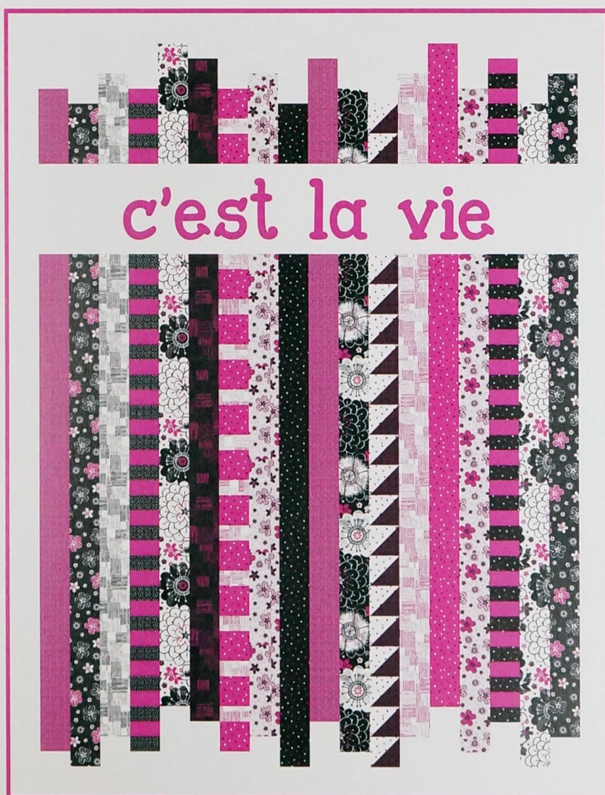
Quilt Designed by Sassafras Lane Designs 40" x 52"